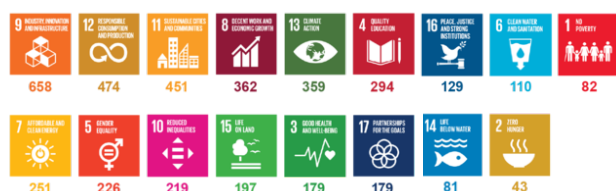
Aalto University courses with SDG content 1–3 most relevant SDGs chosen per course