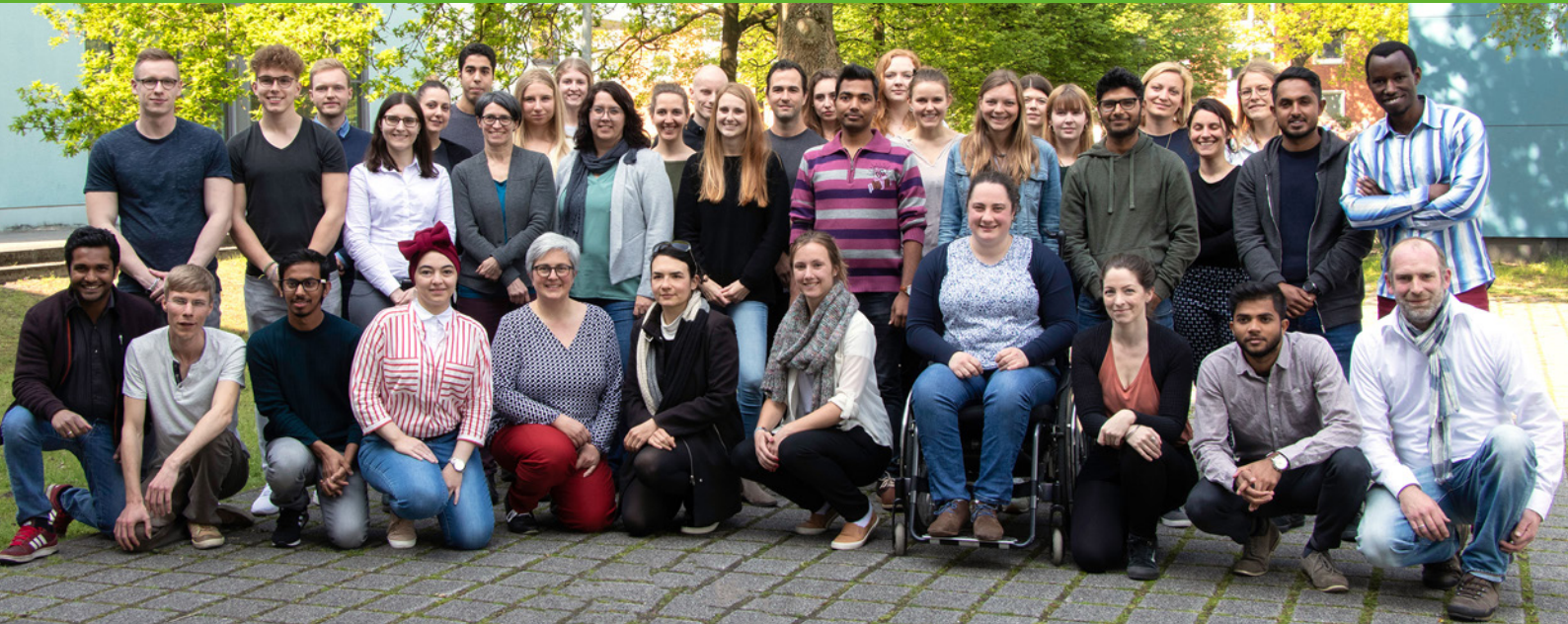
Organizing Team at the University of Oldenburg